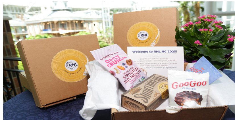
RNLNC 2023 Swag Box goodies