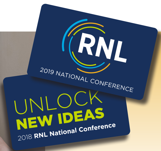
Key cards from previous RNLNC