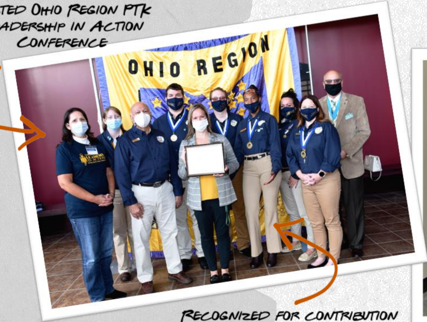
RECOGNIZED FOR CONTRIBUTION TO THE GROWTH OF PTK IN THE OHIO REGION