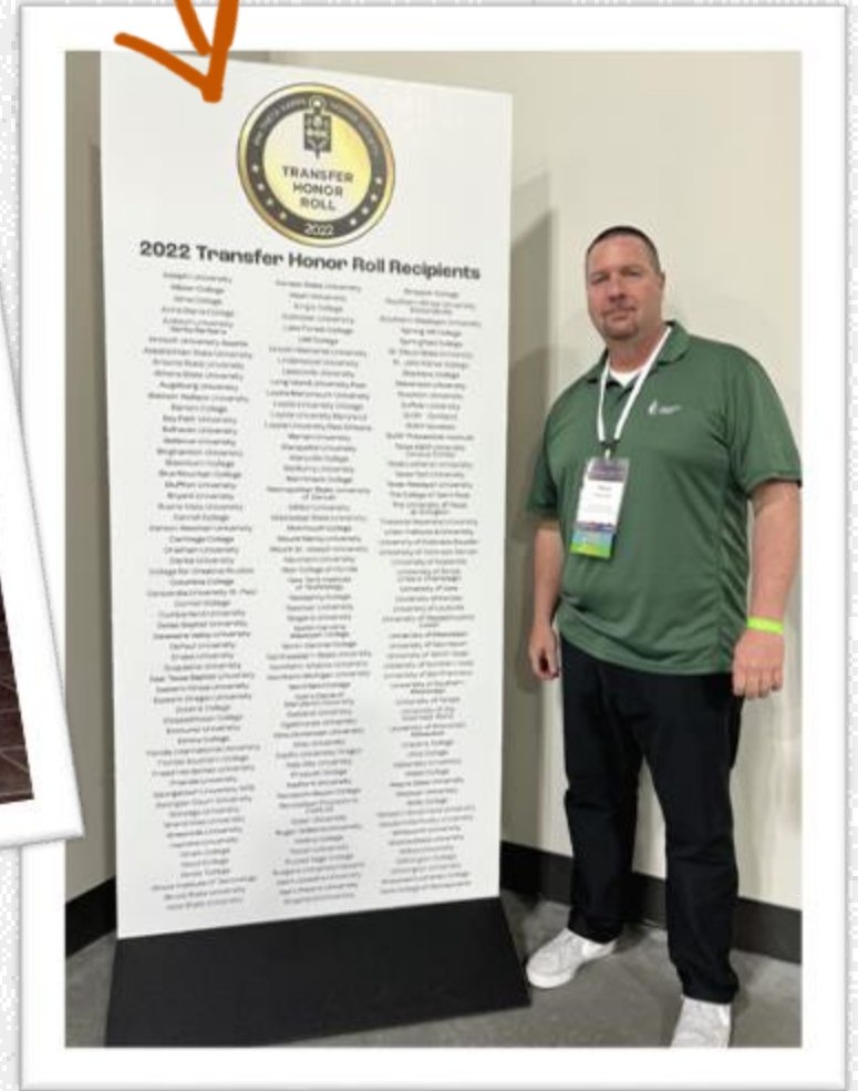
ATTENDED CATALYST CONFERENCE